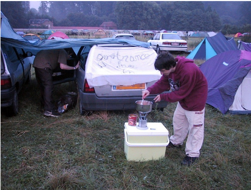
goatrance.free.fr members attending some foggy festival