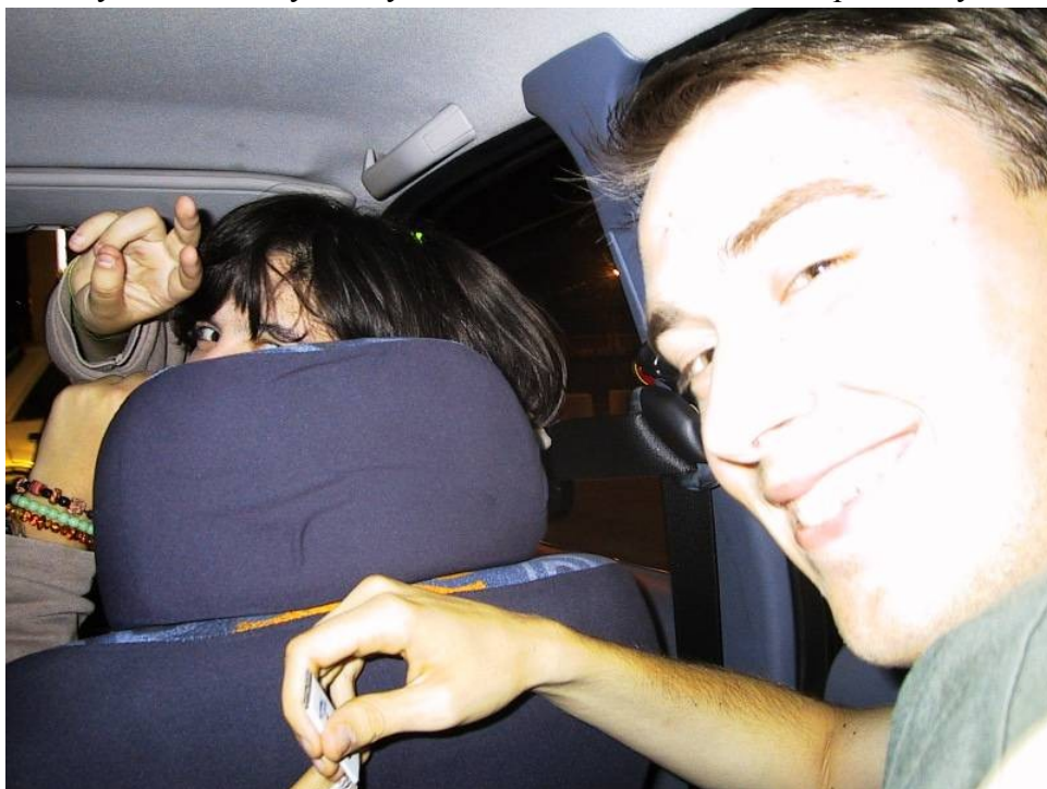
Children on the right