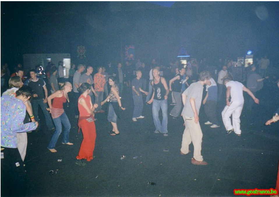
Party people having a good time