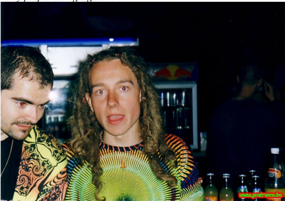
Mars and Anoebis holding the bar