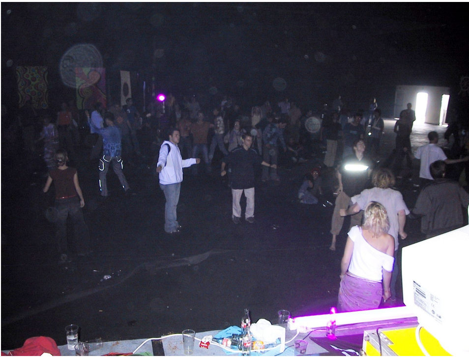
It's 1 PM, people are still there !